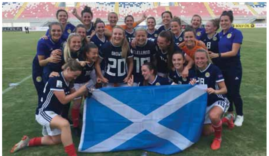
Below: The Scotland Women's National Team celebrate qualifying for the 2019 World Cup.