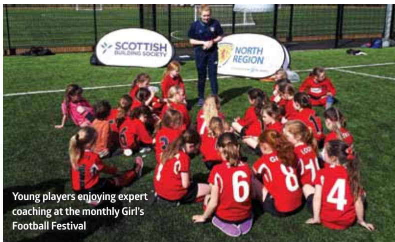
Young players enjoying expert coaching at the monthly Girl's Football Festival