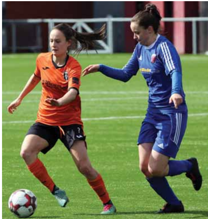
Left: Glasgow City and Forfar Farmington battle it out for points